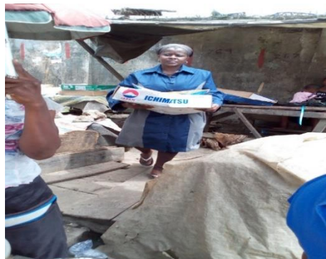
Fig 5: Carton lifting and walking.