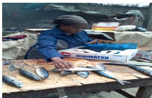
Fig 6: Arm movement