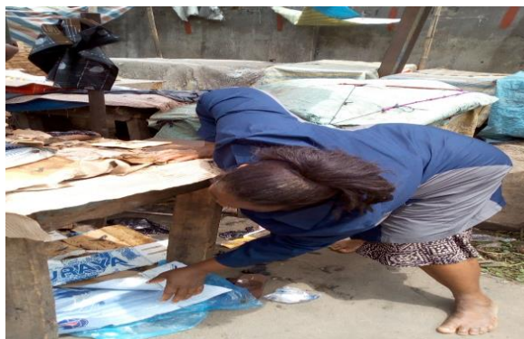
Fig 4: Bending movement