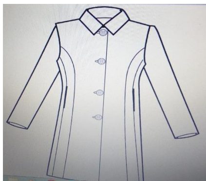
Fig 3: Three quarter coat