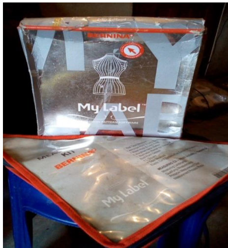
Fig 1: Bernina My Label Software